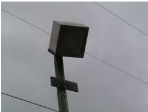
old high pressure sodium vapor light