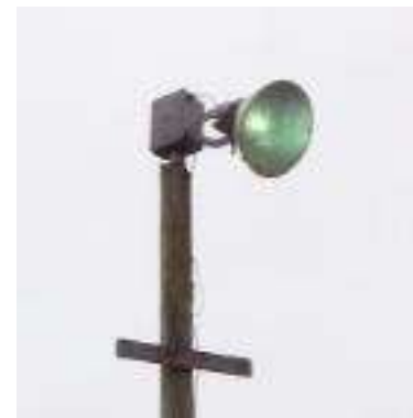
new metal halide light