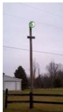
new light installed